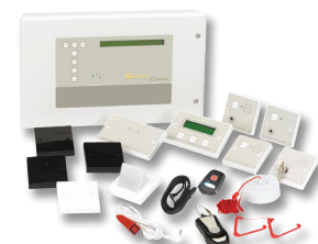
Addressable Call Systems