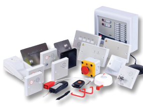
Conventional Call Systems