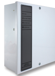
NC925B1 12V 1A WHITE BOXED PSU