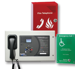
Disabled Refuge Systems