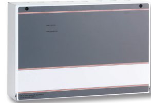
BF377 24V 2A UNREGULATED DOOR RELEASE PSU