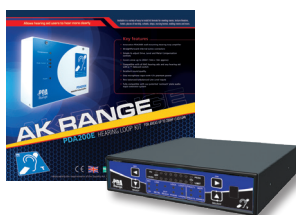
Hearing Loop Systems