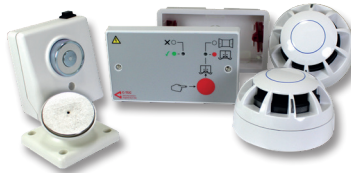
BF375PEK 24V 250MA DOUBLE GANG AUTOMATIC DOOR RELEASE SYSTEM