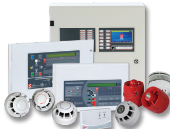
Addressable Fire Systems