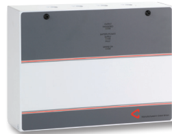
BF375M 24V 1A REGULATED PSU