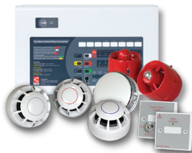
Conventional Fire Systems

In addition to the power supplies detailed in this brochure, we also manufacture the following:-