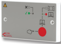
BF375PE 24V 250MA UNREGULATED DOOR RELEASE PSU C/W DETECTOR CIRCUIT